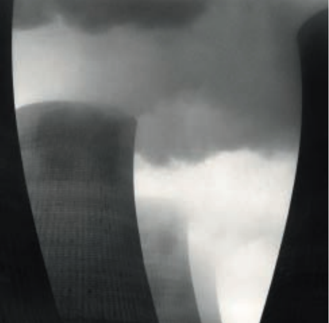
I like having something so consistent that I can have photographs from 1975 sit next to photographs from 2005 and they're at peace. It's as if my whole family of photographs merge, the old pictures can live with the new pictures, and I like that.